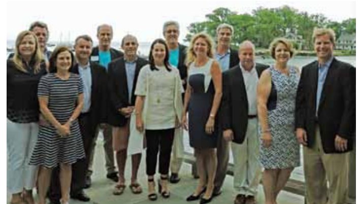
Above: Members of the Host committee for Save the Sound's event at the Noroton Yacht Club.