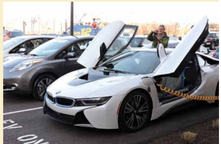
This spring, CFE and the Stamford 2030 District celebrated Earth Day with an electric vehicle ride-and-drive event.