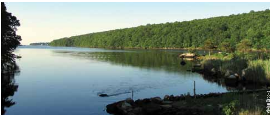
This summer, CFE officially joined the fight to protect Oswegatchie Hills, the pristine 700-acre East Lyme property overlooking the Niantic River, from unbridled development.

"Protecting Oswegatchie Hills from the kind of aggressive overdevelopment currently being proposed is critical to the water quality of the Niantic River," says Fred. "We're pleased that CFE is bringing its considerable legal and scientific expertise to bear to work to protect this unique natural area."